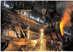
Iron and Steel