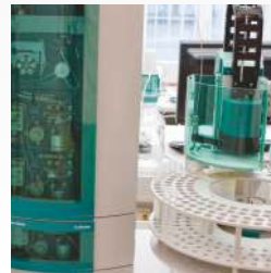
Gas, Liquid & Ion Chromatography