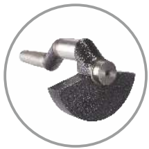
Single piece crankshaft