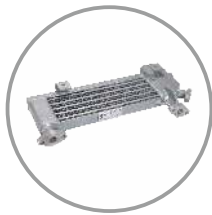
Flanged aluminium aftercooler