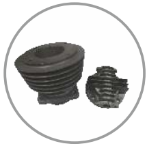
Cylinders specially coated for wear and corrosion resistance