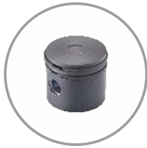
PTFE coated pistons and PTFE rings