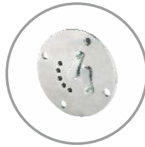
Stainless Steel reed valves