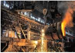
Iron and Steel