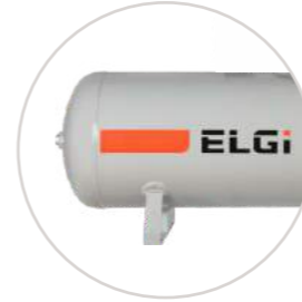
Safety and capacity ensured with ASME designed receiver tank