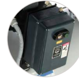
Starter and pressure switch of proven reliability over time