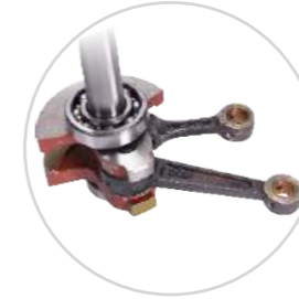
Assured longer life with cast iron and forged steel components