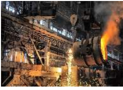
Iron and Steel